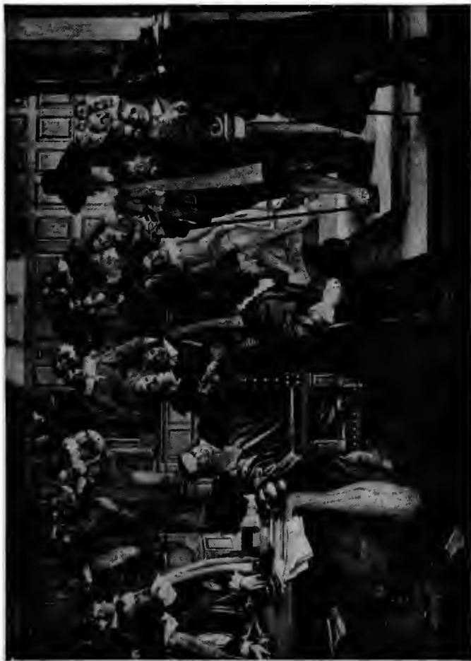
The King demanding the Surrender of the Five Members